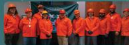
Right: Koppers Performance Chemicals of Millington joined the Green Star Partnership in May 2023. Koppers Performance Chemicals produces several proprietary chemicals used in wood preservation, including MicroPro®, MicroShield, and the NatureWood family of products.