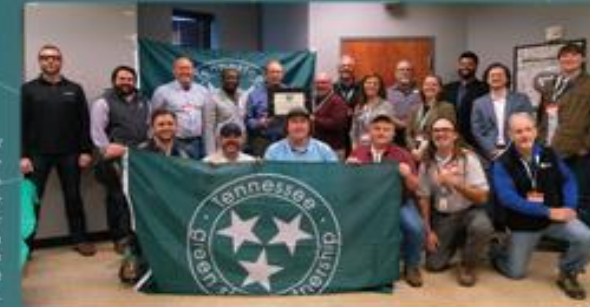
Right and Below: Nucor Steel Memphis, Inc. joined the Green Star Partnership in November 2022. Nucor Steel Memphis produces special bar quality (SBC) steel using an electric arc furnace (EAF). The mill, which Nucor began operating in 2009, melts recycled scrap metal and turns it into new steel products.